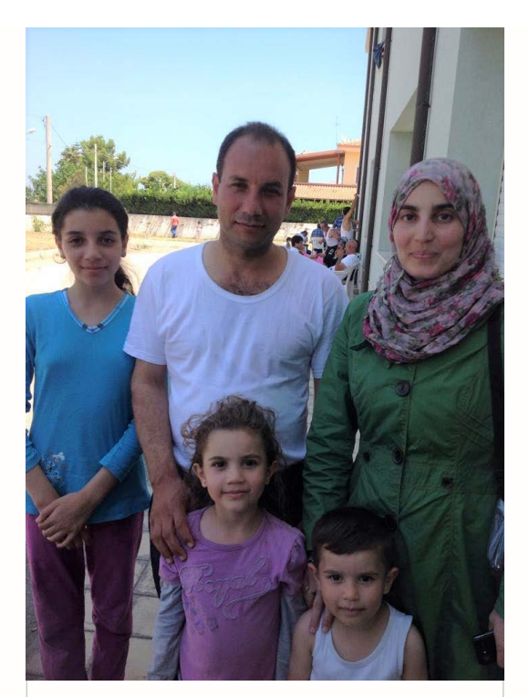
Syrian Refugees family

speak with them. I was always very careful about how I approached them and where I met them. I wanted them to feel comfortable. And I always stressed that they had no obligation to talk to me and that not talking to me would not jeopardize their asylum applications in any way something they were very afraid of. Then, it was like snowball sampling - I'd talk to one refugee and say if you have any friends who would like to speak with me, please