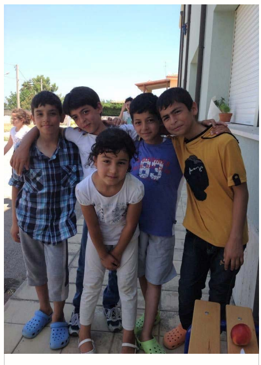
Syrian girl and boys