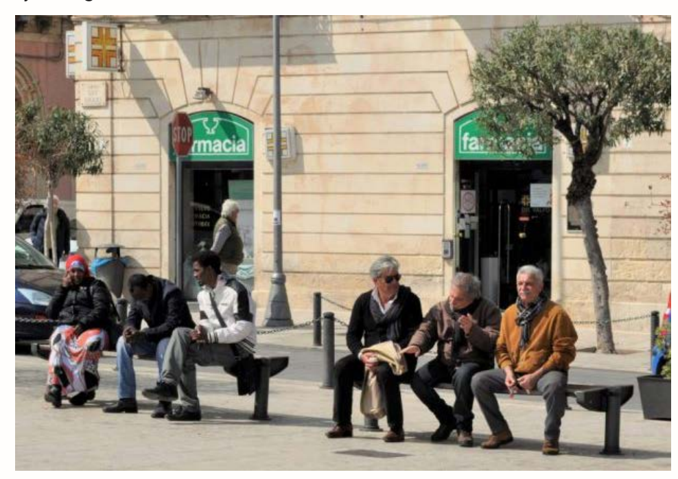
Refugees and Sicilians in Siracusa