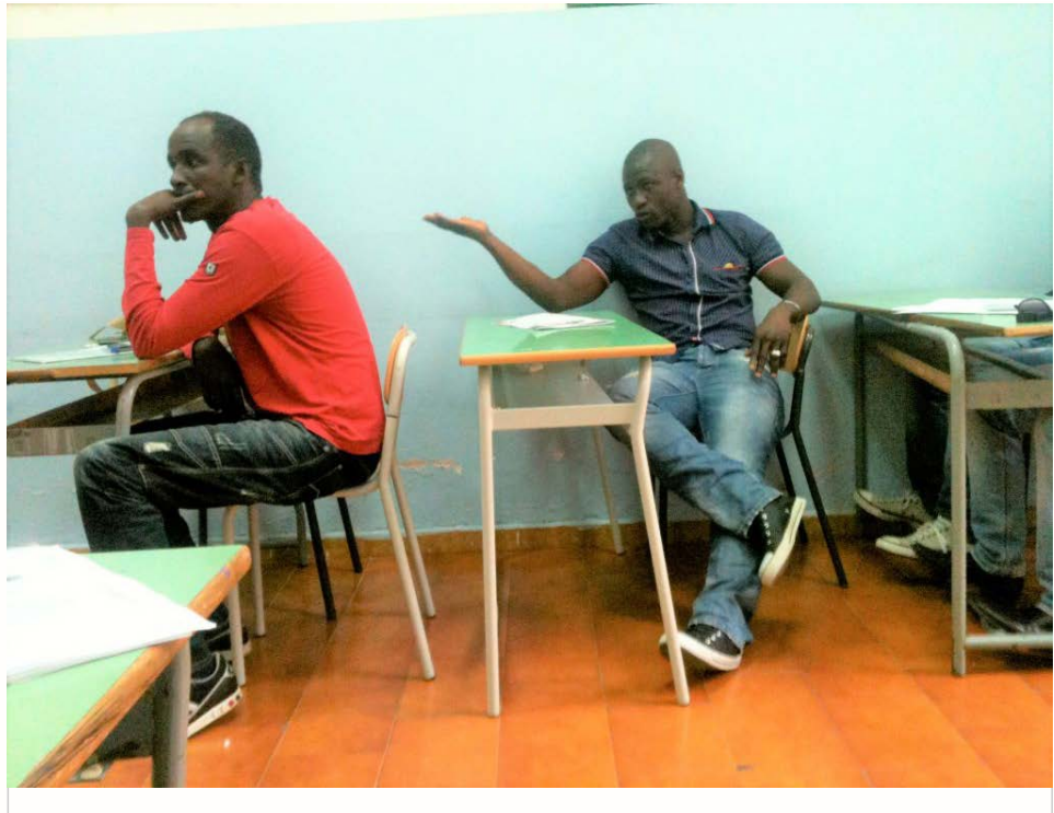
Refugees Sicily, classroom

Refugees , she says, don't want to be in Sicily. "They stay because they have nowhere else to go. I wanted to get at the basic humanity of these people. At the time [former prime minister Silvio] Berlusconi had called them something derogatory, and I wanted to pluck individual voices and faces from this nameless, faceless mass. Because people weren't understanding the problem as a human problem, they only wanted to see it as a political problem."