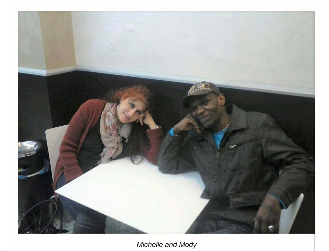
"That doesn't mean that there aren't a lot of good people in Sicily who are working to alleviate their suffering and pain. But like anything in Italy, progress is slow, changing people's minds is slow. That's one of my great frustrations. If it's hard for everyday Italians to get things done, imagine how the refugee feels. Just doing simple things is not easy for them. They can't find housing or jobs, or they're given jobs that are extremely dangerous, where they're working 12 hours in the hot sun with no access to water. It's illegal to do so, but bosses, to threaten them to work, will often take their passports or other official papers. "The European Union

After being processed through the refugee camps, the new arrivals go to centers, "where there's a place to sleep, a kitchen to cook in." The centers are run mainly by local women. "There are all sorts of problems in that regard; the pushing of the Catholic religion on predominantly Muslim men was hard for me to swallow. One Christmas there was a party for the refugees and most if not all were Muslims. The women asked everyone to stand up and one of the women led us in the Our Father. One of the first things she said was, 'You are in a Catholic country now and this is how we pray.' You have African men who have a sense of themselves and a deep sense of pride. Then you have Italian women who are either willfully ignorant of other peoples' cultures or simply ignorant, who are basically telling these men when they can eat, what time lights are out, what time they have to come back to the center before the doors are locked. It was difficult for me to watch."